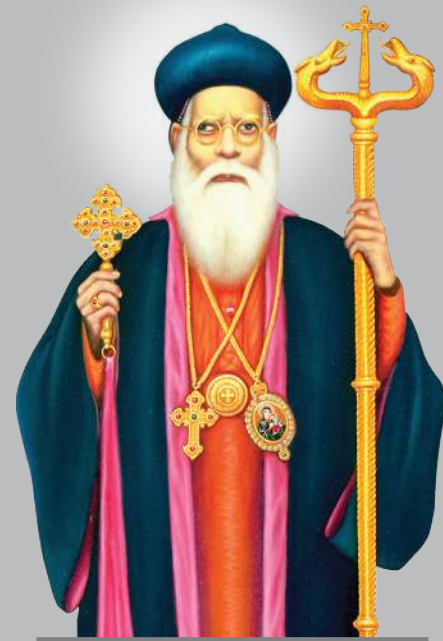
St. Geevarghese Mar Dionysius (31.10.1858 to 23.2.1934)